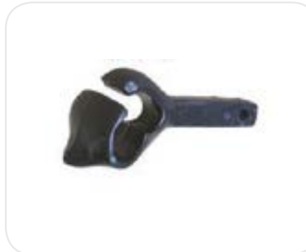
Bead Holder Keeps Truck tyre Bead from slipping