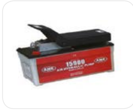
10 Ton Air Hydraulic Pump 2.3l - Polyethylene Reservoir