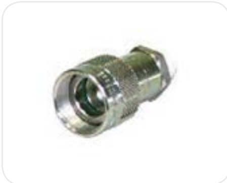
High Flow Coupler Hose Half Female