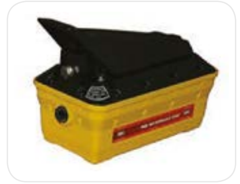
10 Ton Air Hydraulic Pump 3.2l Turbo - Polyglass Reservoir