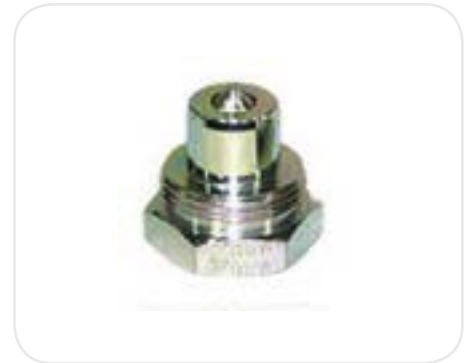
High Flow Coupler Hose Half Male