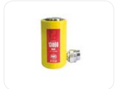
30 Ton Hydraulic Rear Bead Breaker Ram Min Height: 118mm | Stroke: 61mm