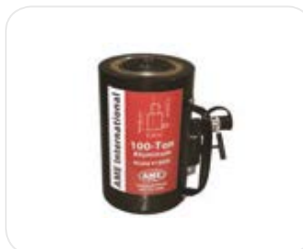
55 Ton Hydraulic Jack Ram Min Height: 305mm | Stroke: 150mm