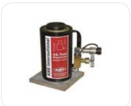
55 Ton Hydraulic Jack Ram Min Height: 310mm | Stroke: 150mm