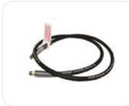
3m High Pressure Hose