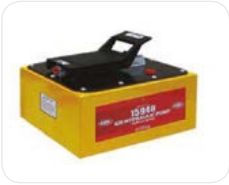
10 Ton Air Hydraulic Pump 7.7l - Steel Reservoir | 700 Bar