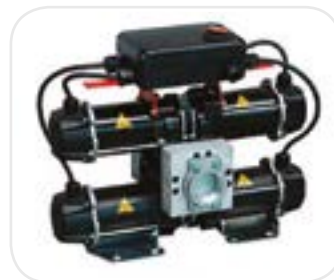
24v Diesel Vane Pump 155 - 185 l/m | 2 Bar 30min Duty Cycle