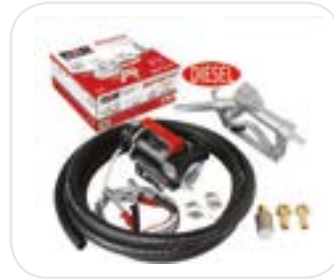
12/24v Diesel Pump Kit 50l/m 22amp | 30min Duty Cycle 4m Hose | Suction Filter