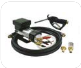
12v Diesel Pump Kit 56 l/m 35amp | 20min Duty Cycle | 4m Hose | Suction Filter