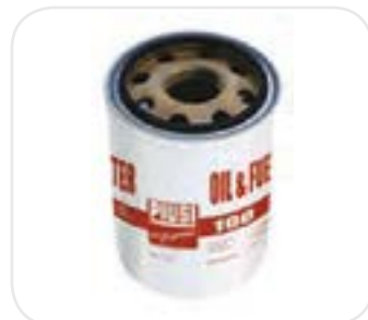
Filter Cartridge 100 l/m