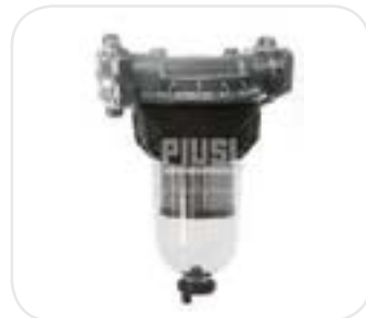
Filter Head, Bowl & Strainer 100 l/m