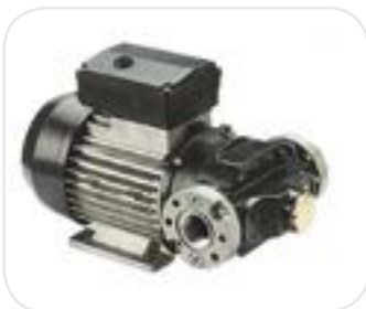
380v Diesel Vane Pump 70l/m