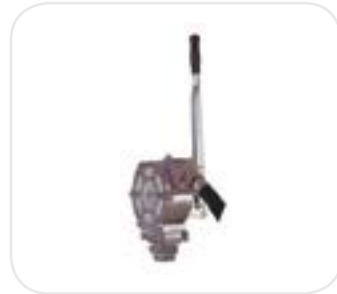
Rotary Drum Pump 65l/m Suitable for Avgas Excluding Hose