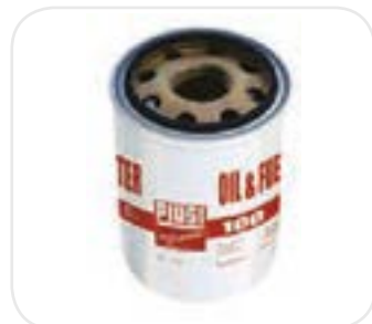
Filter Cartridge 60 l/m