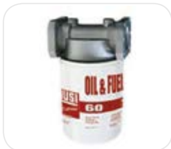
Filter Head & Cartridge 60 l/m