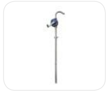
Rotary Drum Pump Oil | Petrol Polypropylene 30l/m @ 60rpm