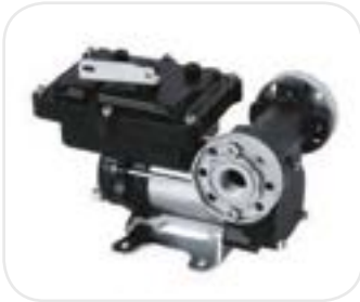
12v Petrol Pump 50 l/m 21amp | 20min Duty Cycle intergrated bypass valve.