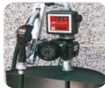
220v Diesel Vane Pump Kit K33Mete | Control | Hose | Bung