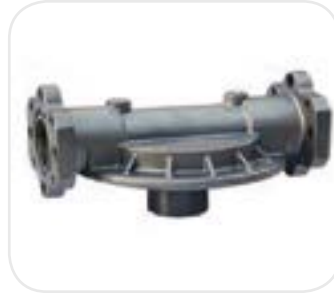
Filter Head Only 100 l/m | 171mm - 16UNF