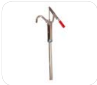
Lever Action Transfer Pump 25l/m