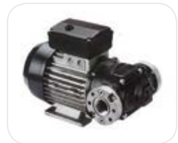
220v Diesel Vane Pump 70/100 l/m