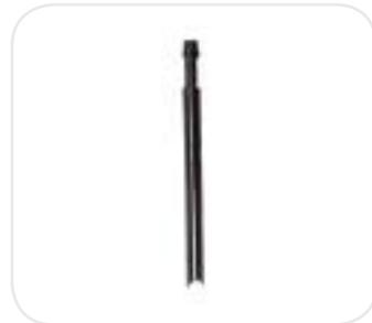
Riser Tube Extendable Plastic: 560-1100mm