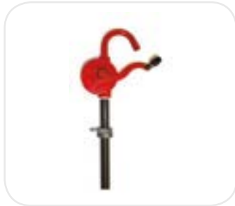
Rotary Transfer Drum Pump 45l/m @ 60rpm