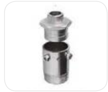
Bung Adaptor 3/4" BSP x 2"