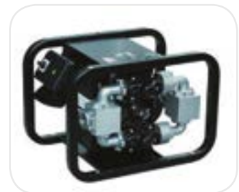
220v Diesel Pump 200 l/m | 2.5 Bar 30min Duty Cycle