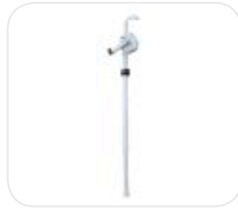
Rotary Drum Pump Oil | Petrol Teflon 30l/m @ 60rpm