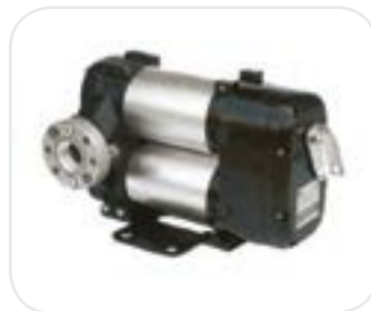
12v Diesel Bi Pump 56 l/m 35amp | 20min Duty Cycle