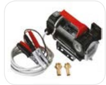
12/24v Diesel Pump 50l/m 22amp | 30min Duty Cycle