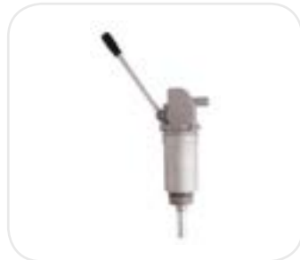
Piston Drum Pump 23l/m