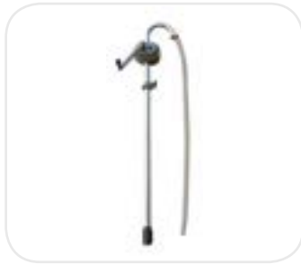
Rotary Drum Pump Oil | Diesel | Petrol Alluminium 15m Vertical | 50m Horizontal