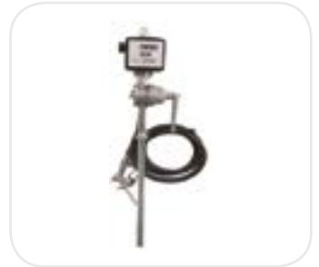
Rotary Drum Pump Diesel | Oil Meter, Control & Hose