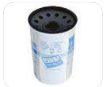
Filter Cartridge H 2 O Absorbing 70 l/m