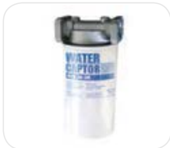
Filter Head & Cartridge H 2 O Absorbing 70 l/m