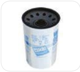
Filter Cartridge H 2 O Absorbing 150 l/m