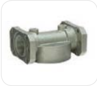
Filter Head Only 70 l/m | 1000mm - 12UNF