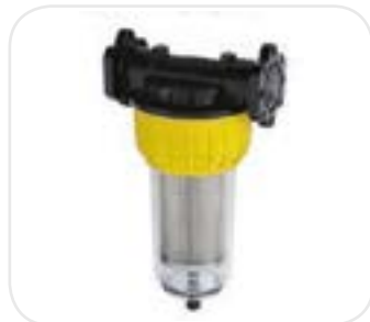
Filter Head, Bowl & Cartridge H 2 O Absorbing 70 l/m