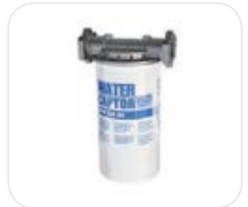
Filter Head & Cartridge H 2 O Absorbing 150 l/m