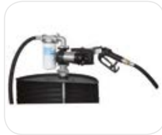
12v Petrol Pump Kit 50l/m 21amp | 30min Duty Cycle Hose | Filter | Bung | Tube