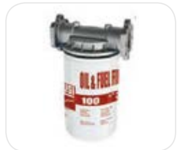
Filter Head & Cartridge 100 l/m