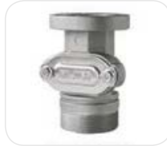
Drum Bung Connector with Valve & Strainer