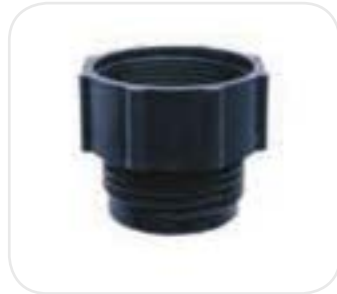
Bung Adaptor 210L Plastic Drum Suitable for manual pump