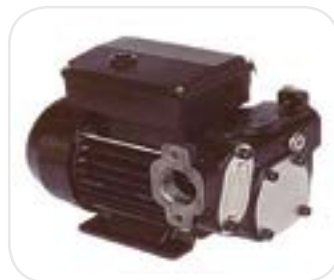
220v Diesel Vane Pump 56l/m