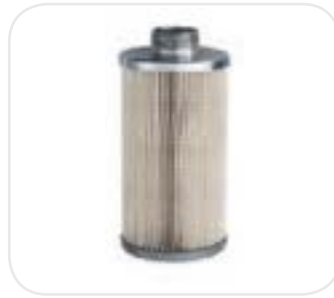
Filter Cartridge H 2 O Absorbing 70 l/m