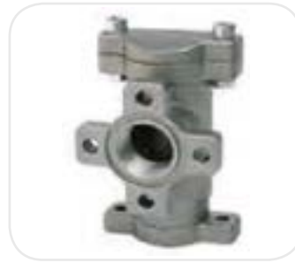
Strainer Inline K33/K44