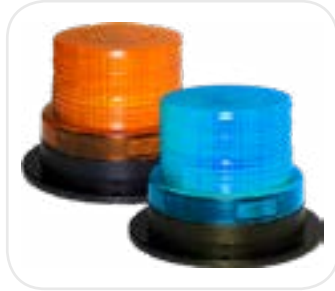
Flat Top Small LED 9w HDE00103