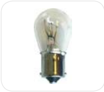
Lamps 12/24v HDE00122