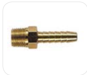
High Flow Couplers Connector | Male Hose Barb