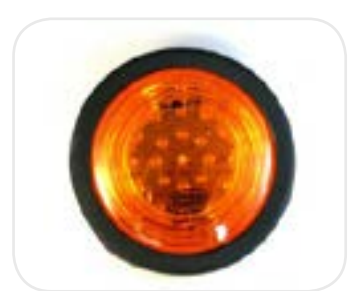
Amber Truck Light HDE00113