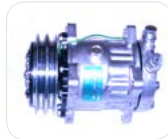
Sanden SD7H15 24v HDE00131