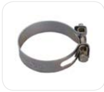
Hose Clamp Medium