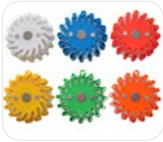
Sirencos Emergency Flare HDE00102