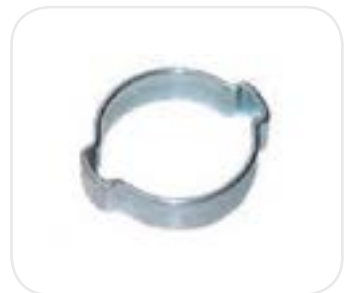
Hose Crimping Sleeve