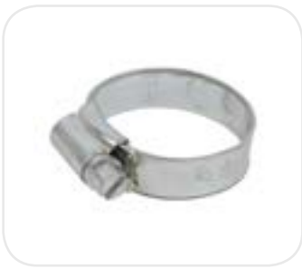
Hose Clamp Galvanized