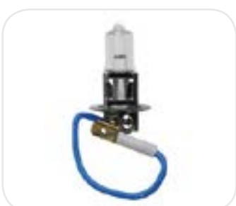
Lamps 12/24v HDE00118