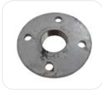
Flange Galvanized Screwed