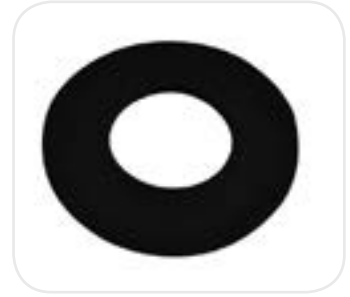
Rubber Ring IR