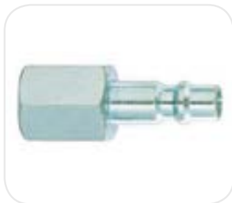
High Flow Couplers Connector | Snap-In x Female