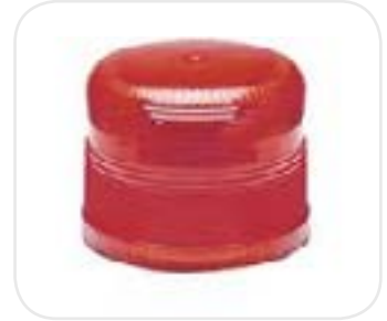
Beacon Light Lids HDE00105