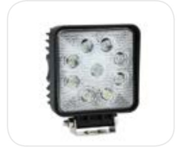
Iconiq Lamp Spot Beam HDE00109