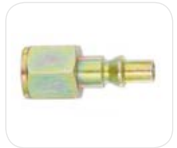
Standard Flow Couplers Connector | Snap-In x Female