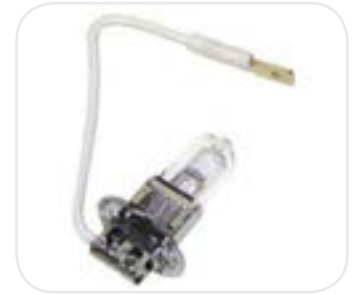
Lamps 12/24v HDE00125