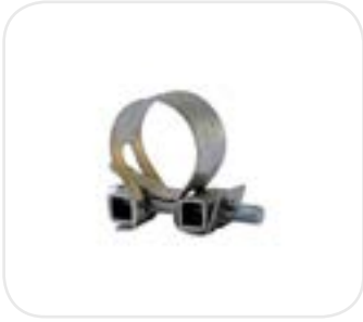
Hose Clamp Utility