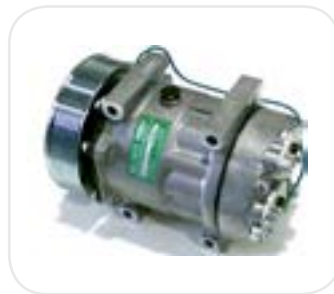
Sanden Volvo 24v - Fixed Mount - HDE00134