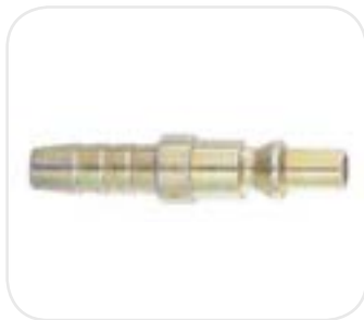
Standard Flow Couplers Connector | Snap-In x Hose Barb