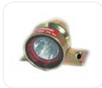
Scoop Lamp HDE00112