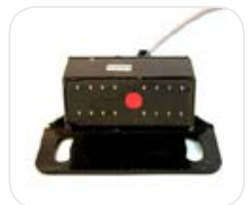
18 LED Red Marker Light HDE00116