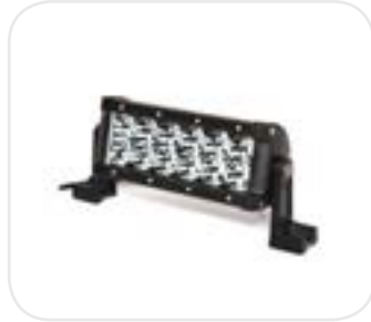
LED Light Bar: 36 - 180w HDE00107