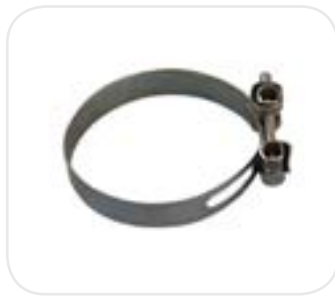
Hose Clamp P-R