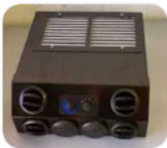
Evaporator 12/24v Cooling Capacity: 13700 BTU 6 Adjustable Louvres HDE00137