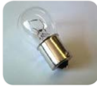
Lamps 12/24v HDE00127