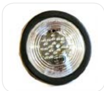
Clear Truck Light HDE00115