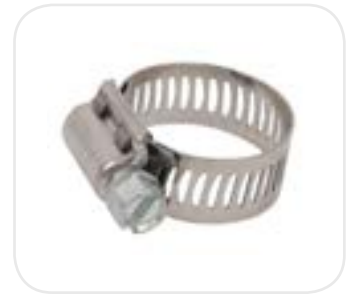
Hose Clamp Euro Type