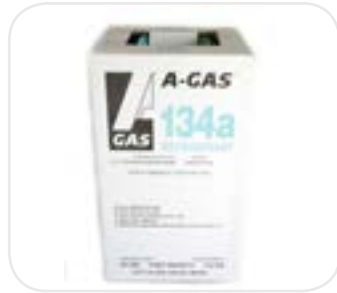
R134a Gas 13.6kg Disposable HDE00145