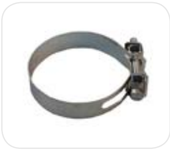
Hose Clamp 1B