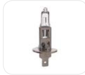
Lamps 12/24v HDE00128