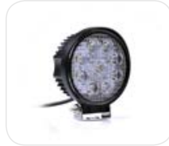
Iconiq Lamp Spot Beam HDE00108