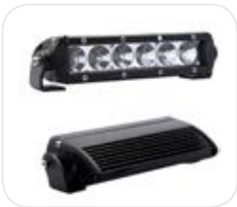
Steel LED Flashers 10v - 30w HDE00110