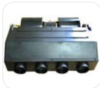
Blower Motors HDE00138