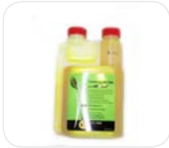
Leak Detection Dye - 240ml HDE00139