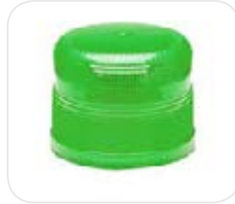
Beacon Light Lids HDE00104