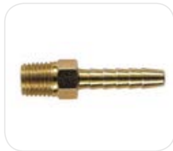
Standard Flow Couplers Connector | Male Hose Barb