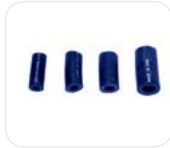
Goodyear Barrier Hose HDE00142