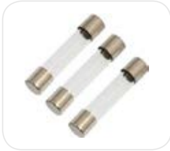
Glass Fuses HDE00126