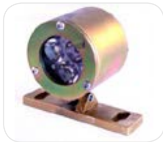
3 Eye LED Casted HDE00111