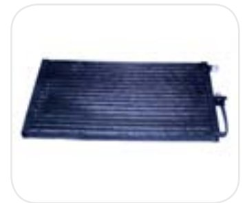
O-Ring (580x350x22) HDE00136