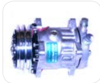
Sanden SD7H15 12v Double V/Groove - HDE00130