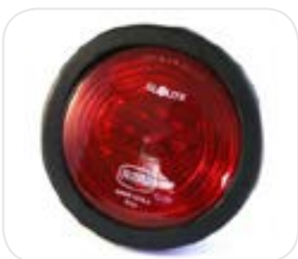
Red Truck Light HDE00114