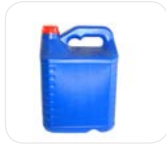
Vacuum Pump Oil HDE00147