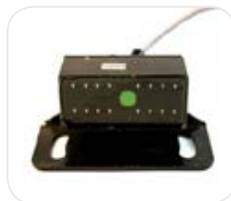
18 LED Green Marker Light HDE00116