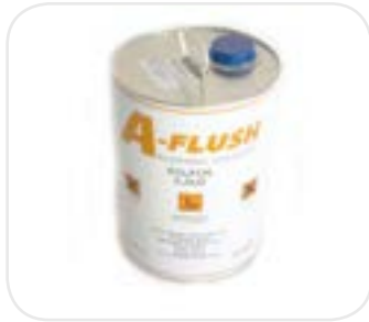
Flushing Fluid - 5L HDE00144