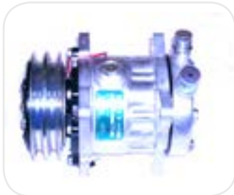
Sanden SD7H13 12v Double V/Groove - HDE00129

LED assorted replacements lamps on request