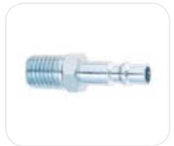
High Flow Couplers Connector | Snap-In x Male