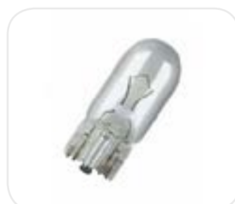
Lamps 12/24v HDE00120