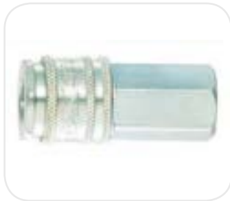
Standard Flow Couplers