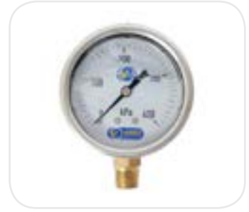
Gauge TBT Pressure