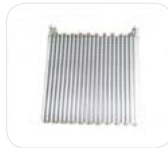
Tube & Fin (600x570x45) HDE00135