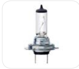
Lamps 12/24v HDE00123