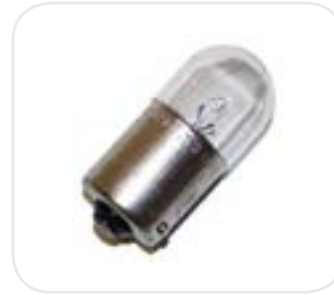
Lamps 12/24v HDE00124