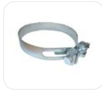
Hose Clamp HD YZP