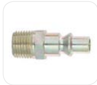
Standard Flow Couplers Connector | Snap-In x Male