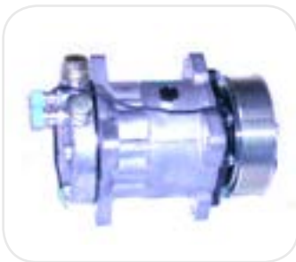
Sanden 7H15 12v - 8pk Pulley HDE00133