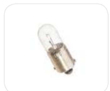
Lamps 12/24v HDE00121