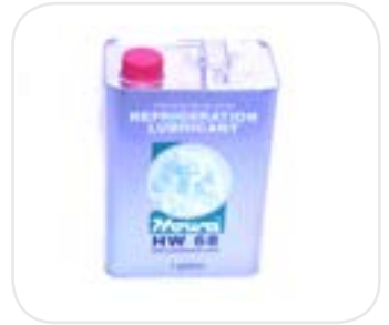
HW68 Compressor Oil - 4.5L HDE00143