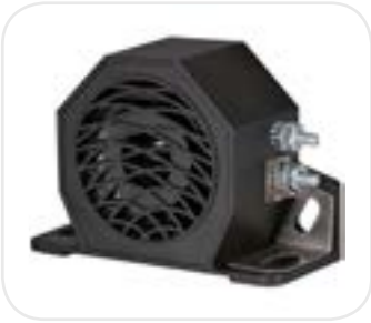
Safety Reverse Alarm HDE00106