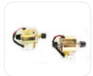
Solenoid Valve 3/8 O-Ring HDE00148