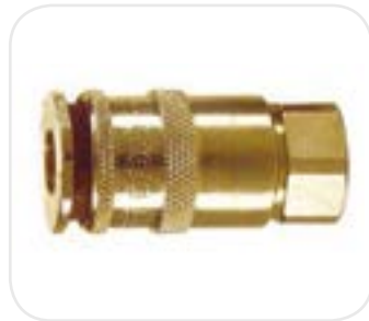
High Flow Couplers