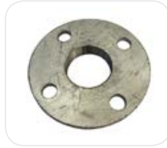
Flange Black Weld