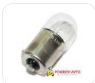
Lamps 12/24v HDE00119