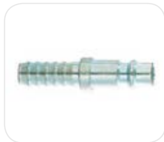
High Flow Couplers Connector | Male Hose Barb